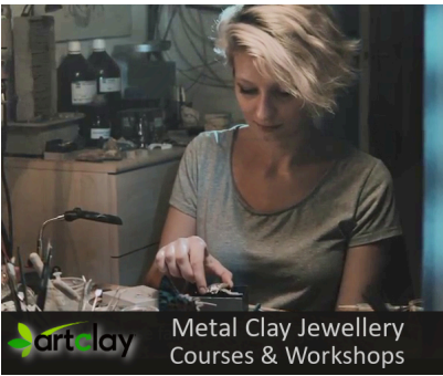
Metal Clay Jewellery - Courses and Workshops