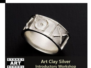
SYDNEY ART SCHOOL Art Clay Silver Introductory Workshop