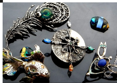
art lay Metal Clay Jewellery Courses & Workshops