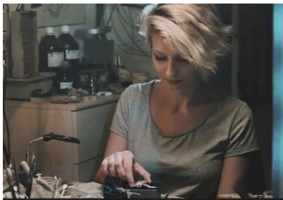
art lay Metal Clay Jewellery Courses & Workshops