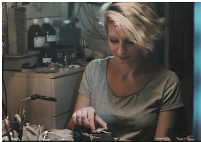
art lay Metal Clay Jewellery Courses & Workshops