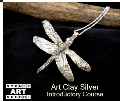
SYDNEY ART SCHOOL