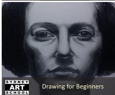
Drawing for Beginners

Introductory drawing course with a blend of skills development and creative expression. Covers skills, techniques, media and equipment, and artistic approaches to drawing.