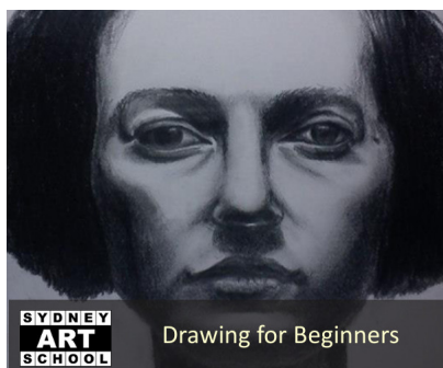
Drawing for Beginners