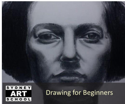
Drawing for Beginners