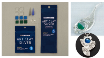
ART CLAY Level 2 | U-0050 Optional design